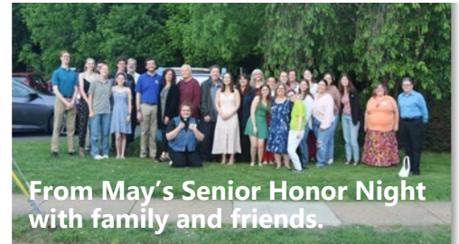
From May's Senior Honor Night with family and friends.