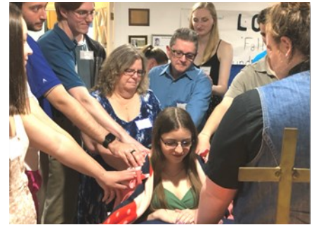
LCM's Senior Honor Night in May was a beautiful occasion, including laying on of hands and prayer for each graduate! †