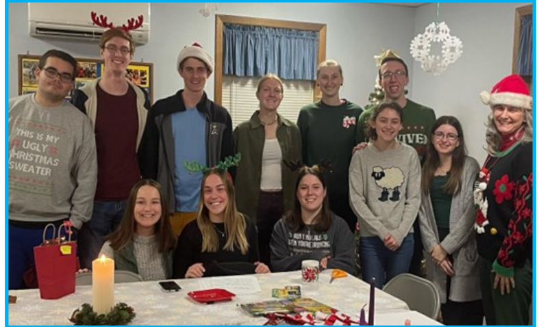
Thank you for your continued support for LCM at UD!

In the area of service, students have continued to volunteer with FISH, Fellowship in Serving the Hungry . FISH is a wonderful cooperative outreach to Newark area families facing food insecurity, together with committed volunteers from St. Paul's Lutheran Church. LCM has enjoyed many social activities over the past year: UDairy ice cream runs, Easter dinner, a spring retreat to Bethany Beach (which included a service project), informal monthly get-togethers for coffee and conversation, a fall retreat to Ocean City, Maryland (along with other synod campus ministries), a fall bonfire at a senior's home, a "Friendsgiving" meal, an Advent brunch, and a joyous Advent Party (pictured below.)